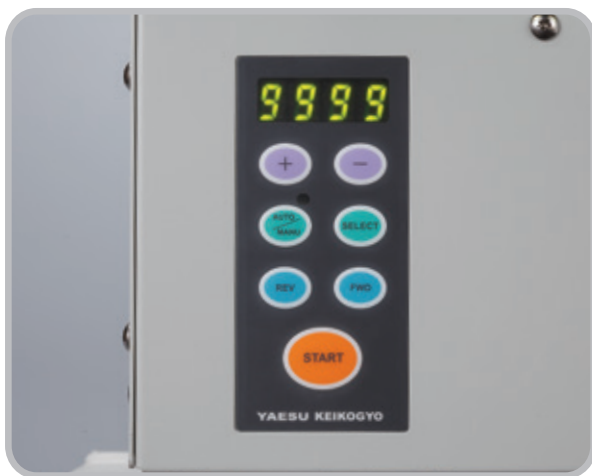
When 4 digital indicates